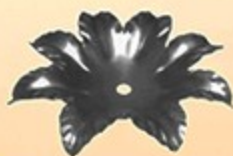
ART. R 36