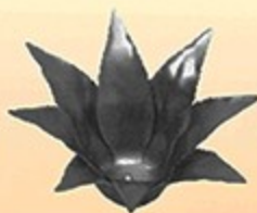
ART. R 37