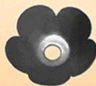
ART. R 38