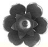
ART. R 44