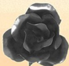
ART. R 51