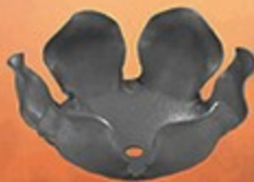
ART. R 54