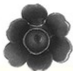
ART. R 45