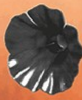
ART. R 42