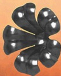
ART. R 41