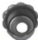
ART. R 33