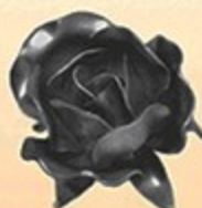
ART. R 50