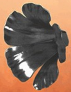
ART. R 43