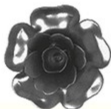
ART. R 46