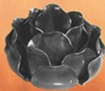
ART. R 55