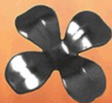
ART. R 40