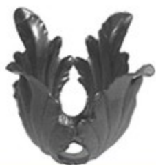
ART. R 35