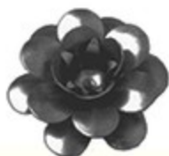
ART. R 47