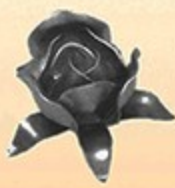
ART. R 49