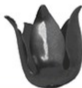
ART. R 34