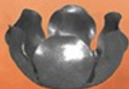
ART. R 53