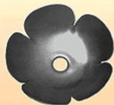
ART. R 39